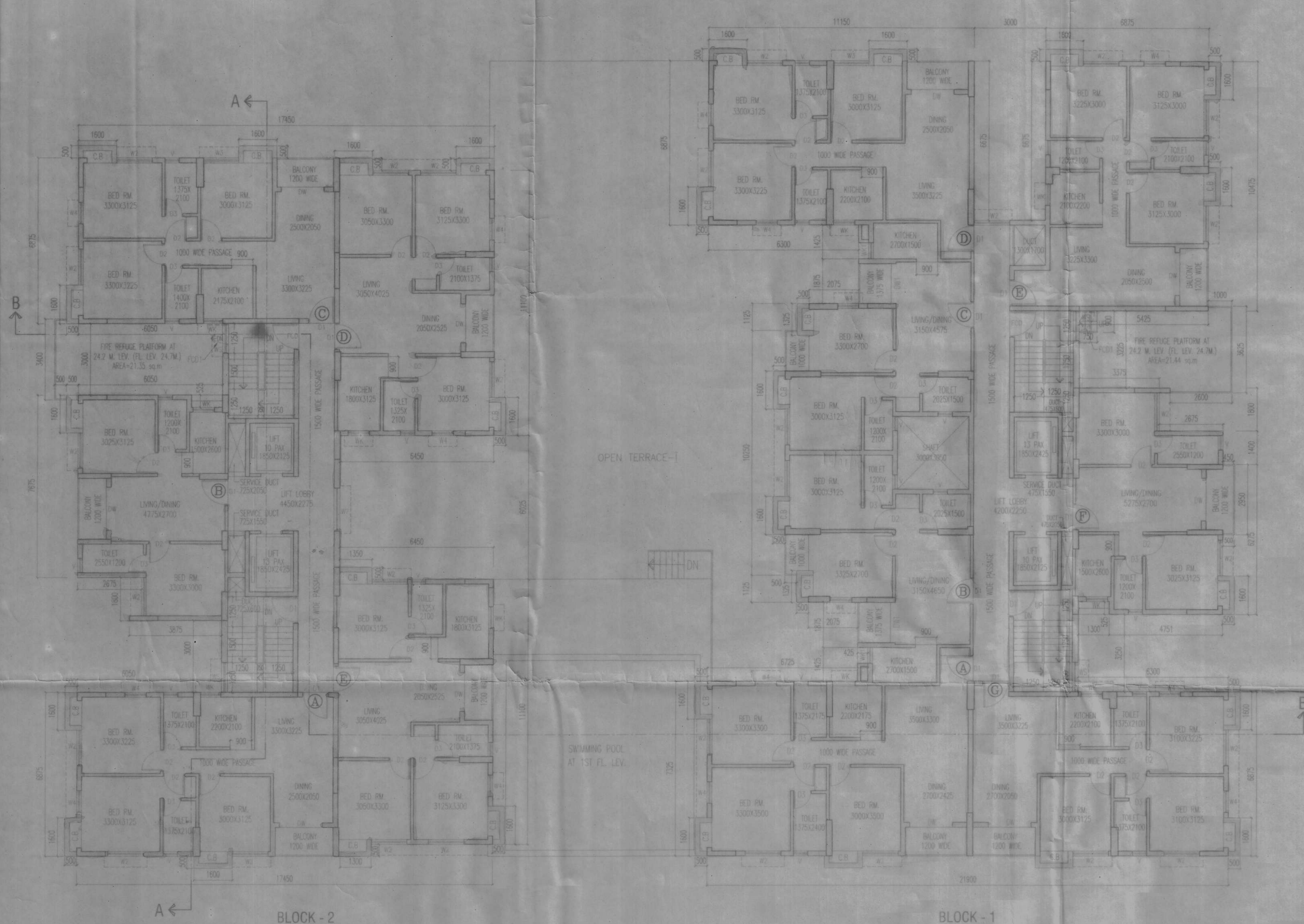
TYPICAL (2ND TO 12TH) FLOOR PLAN SCALE - 1:100